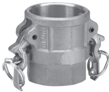
Female Coupler x Female NPT