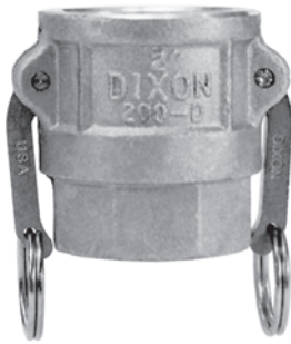
Female Coupler x Female NPT