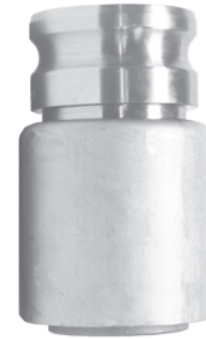
Male Adapter x Hose Shank