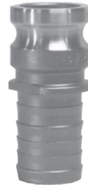
Male Adapter x Hose Shank