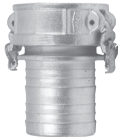
Boss-Lock Coupler x Hose Shank