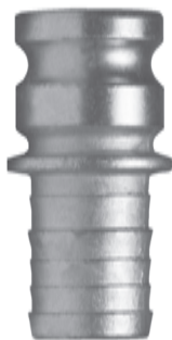
Adapter x Hose Shank