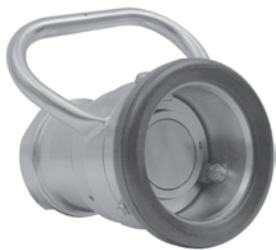
1 1/2" and 2"