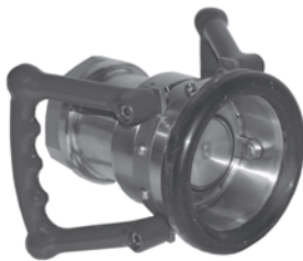
3" and 4"