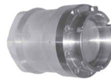
adapter x female NPT