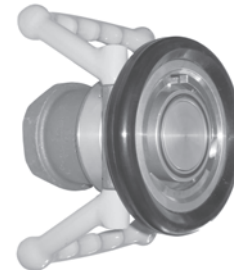
coupler x female NPT