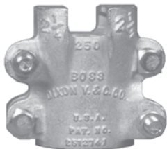
4-Bolt Type 4 Gripping Fingers 1