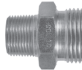
Plated Steel w/ Copper Seat Male Spud