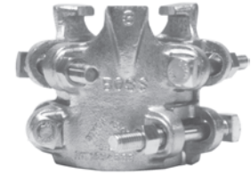
C Boss Fittings