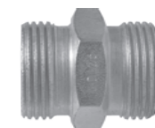
Plated Steel w/ Copper Seat Double Spud