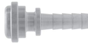
Plated Steel Stem