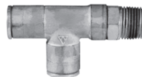
(Tube to Male NPTF)