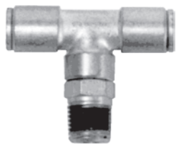
(Tube to Male NPTF)