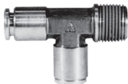
(Tube to Male NPTF)