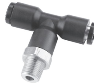
Male Branch Tees (tube to male NPTF to tube)

Note: This fitting orientates 360° on its threaded base.