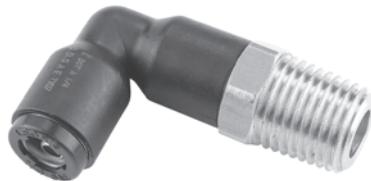
Male Elbows (tube to male NPTF)