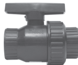
Female NPT x Female NPT