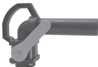
Female NPT x Nozzle