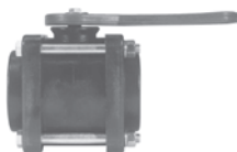
Female NPT x Female NPT