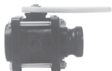
Female NPT x Male Cam and Groove Adapter