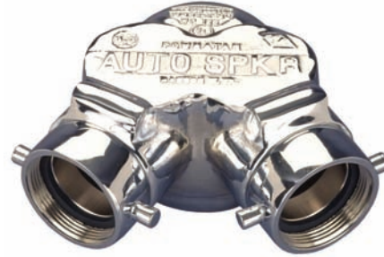
21-133 90° type - (bottom outlet)