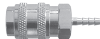
(Standard Hose Barb)