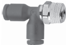
Male Swivel Tee (Tube to Male NPT)

Quick Connect and Disconnect: Simply push tubing in. To remove, press the release ring towards the fitting and pull tubing out. No tools required.