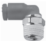
Male Swivel Elbows (Tube to Male NPT)