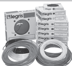
Tubing (100 ft. rolls)