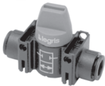
Mini Ball Valves