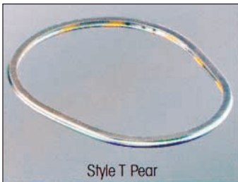
Style T Pear

Supplied in thicknesses of 3.2mm (0.125in.) or 4.5mm (0.175 in.). The standard thickness of 4.5mm (0.175in.) is recommended for use in assemblies where the seat is relatively broad and bolting load is low.