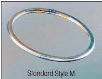
Standard Style M