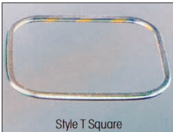
Style T Square