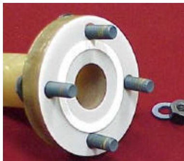
STANDARD "LTC" GASKET

See Reverse Side for Application Information