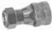
FEMALE PIPE COUPLER