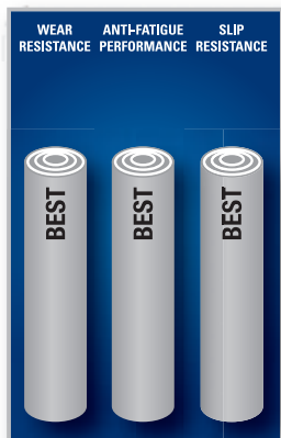
RESULTS from INDEPENDENT TEST LABS & PRESENTED as COMPARISONS to OTHER NOTRAX® INDUSTRIAL MATS