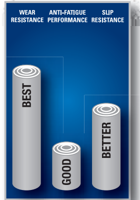
RESULTS from INDEPENDENT TEST LABS & PRESENTED as COMPARISONS to OTHER NOTRAX® INDUSTRIAL MATS