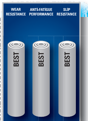
RESULTS from INDEPENDENT TEST LABS & PRESENTED as COMPARISONS to OTHER NoTRAX® FOOD SERVICE MATS