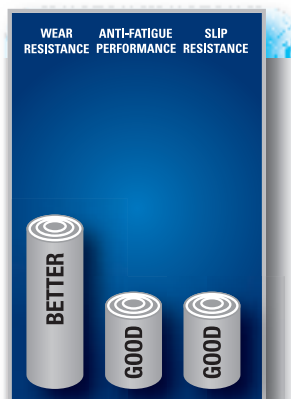
RESULTS from INDEPENDENT TEST LABS & PRESENTED as COMPARISONS to OTHER No-TRAX® FOOD SERVICE MATS