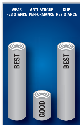
RESULTS from INDEPENDENT TEST LABS & PRESENTED as COMPARISONS to OTHER NoTRAX® INDUSTRIAL MATS