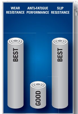
RESULTS from INDEPENDENT TEST LABS & PRESENTED as COMPARISONS to OTHER NoTRAX® INDUSTRIAL MATS