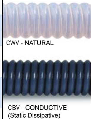
CWV - NATURAL