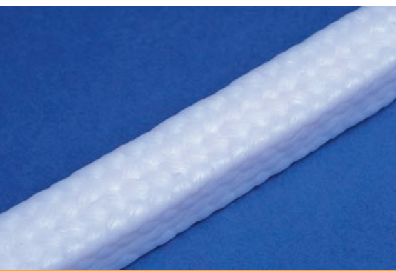
ML 2236 FDA

Remarks: No glazing at higher speed applications, inert, virtually indestructible lower coefficient of friction, thermal resistance to 500°F/260°C; and high compressive strength.