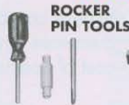
ROCKER PIN TOOLS

D75060 - For "D" Fasteners *For "D" Belting a heavy duty piercing tool (not picture) is supplied complete with Rocker Pin Tool.