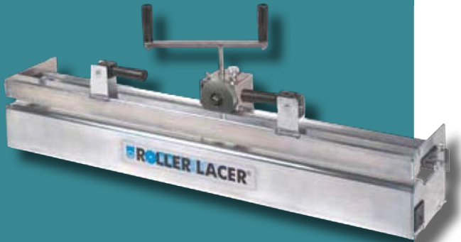
Manual Roller Lacer®