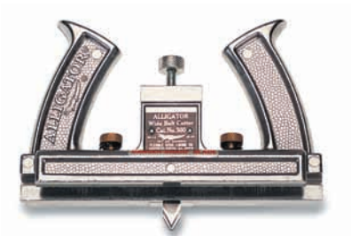
Alligator® 300 Series Cutter for belts up to 1-9/16" (39 mm).

For belts up to 1-1/8" (28 mm) thick, the Alligator® 300 Series belt cutter features a double-edged blade that cuts cleanly in either direction. Also available with an extra-long blade for belts up to 1-9/16" (39 mm) thick.