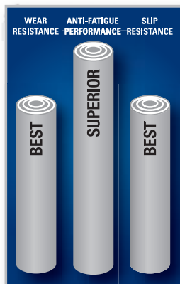
RESULTS from INDEPENDENT TEST LABS & PRESENTED as COMPARISONS to OTHER NOTRAX® INDUSTRIAL MATS