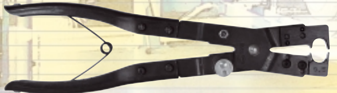
Pincer with return spring for ER Clamps