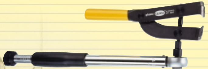
Pincer for Stepless Ear Clamps – Heavy-Duty range