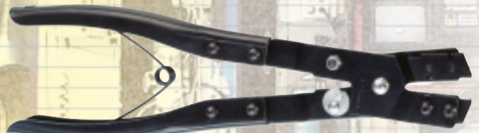
Pincer with return spring for Stepless® Low Profile Clamps