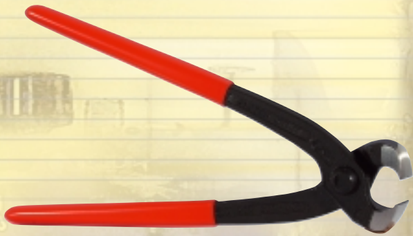
Pincer for Ear Clamps Standard Jaw