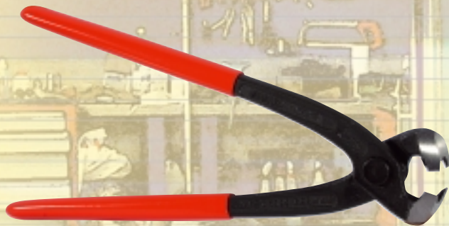
Pincer for Ear Clamps Side Jaw