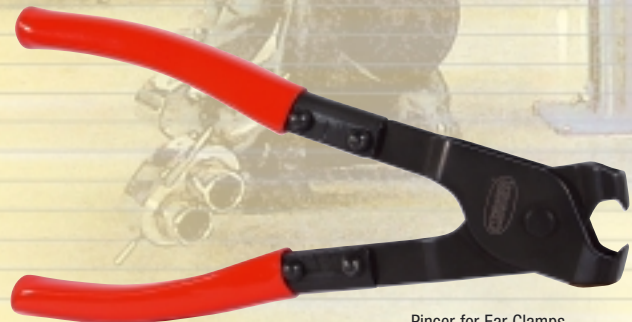
Pincer for Ear Clamps Narrow Jaw