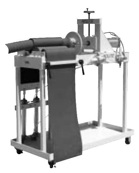
Rolite PT3 Fitting Master Pneumatic Air Tool