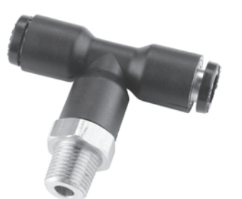
Male Branch Tees (tube to male NPTF to tube)

Note: This fitting orientates 360° on its threaded base.