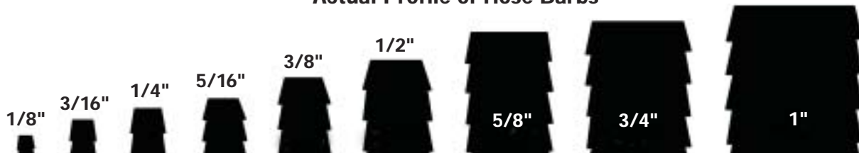
Actual Profile of Hose Barbs