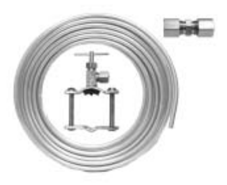
Above w/ Compression Fittings Tubing not flared