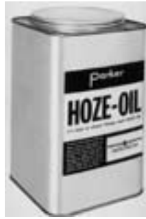
Part Number HOZE-OIL