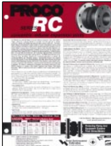
PROCO Series RE Eccentric Reducer Expansion Joints For Blower Service