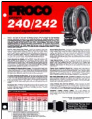
PROCO Series 240/242 Molded Expansion Joints for Blower Service