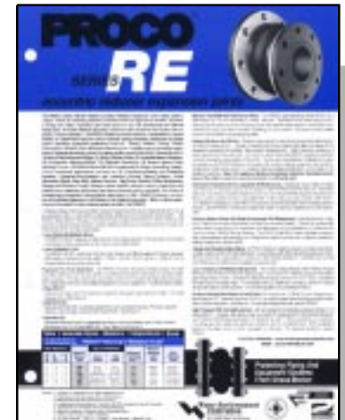
PROCO Series RC Concentric Reducer Expansion Joints For Blower Service

Engineering Note: Non-Metallic flexible fan/duct connectors are critical to system performance. PROCO Products, Inc. encourages each specifying engineer and expansion joint user to become familiar with the F.S.A. Standards and to specify equipment designed in accordance with recommended practices. To obtain a copy of the F.S.A. Technical Handbook, write to the: Fluid Sealing Association • 2017 Walnut Street • Philadelphia, PA 19103