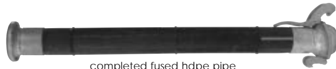
completed fused hdpe pipe

stub ends HDPE SDR11 inserts tapped & coned