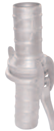
B-style fitting shown.