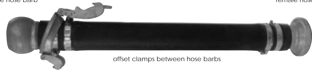
offset clamps between hose bars